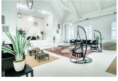
The White Bohemian Mansion

Why June? Because Fulton County GA Commissioners officially declared June 12, 2022, as I AM GIRL GREATNESS™ DAY. So, it's our month to bring this Community of Greatness together to Celebrate Girlhood! We believe "every girl has the right to live well and thrive."